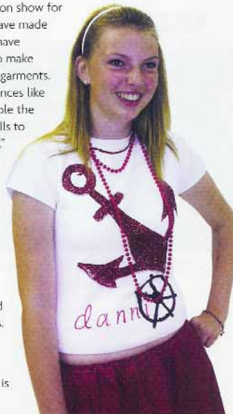
A student models one of the sea-inspired garments

"This week-long fashion summer school is a wonderful opportunity for students to learn practical skills, find out about the fashion industry and showcase their work in a fashion show for parents."